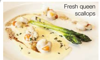
Fresh queen scallops

'It has all the atmosphere of a Victorian country house, and many of its original features including high embossed ceilings and fine wooden