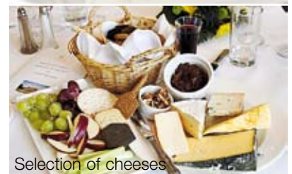
Selection of cheeses