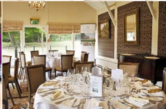
The Camellia Room