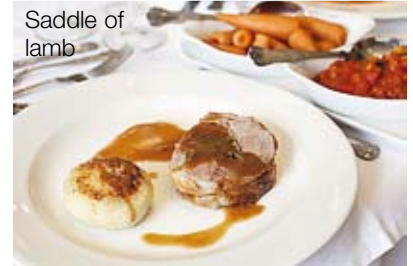
Saddle of lamb